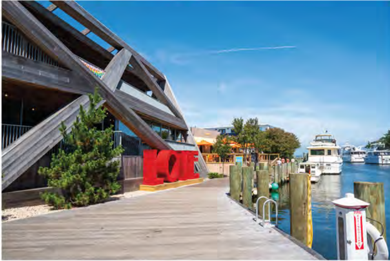
Fire Island Pines Marina | July, 2018

Even though it's only a short distance from Manhattan, Fire Island is a world away from the hustle and bustle of city life. Boasting 32 miles of pristine beaches, Fire Island offers visitors an escape from mainland pressures with beautiful Atlantic Ocean beaches, calming views of the Great South Bay, and access to peaceful wilderness.