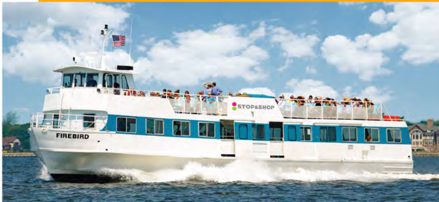
(Port and Starboard Ads)

Captivate our ferry passengers with this prime advertising location. There are currently 4 ferries available for billboard advertisements as pictured.