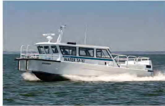
Courier, Water Taxi | July, 2018